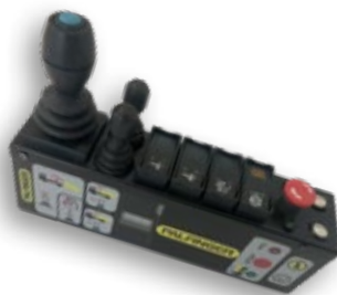
Pro Active Drive