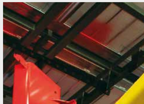
④ Top coat with water based environment friendly two component paint applied on a 100% automation level