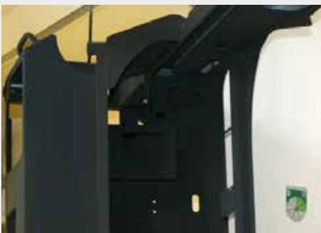
③ Mobile fork lift component with KTL coat