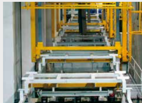
② Specialized preparation including high quality zinc phosphating and KTL coating