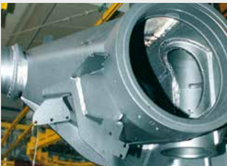
① Sand blasted crane base prepared for the dipping process